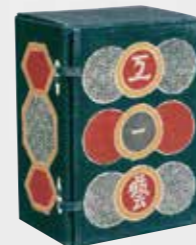
▲ Wrapper for Volumes of Kogei (Craft) Magazine, Stencil-dyed Cotton, about 1932