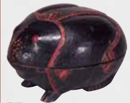
▲ Black-lacquered Container in Frog Form, Thailand