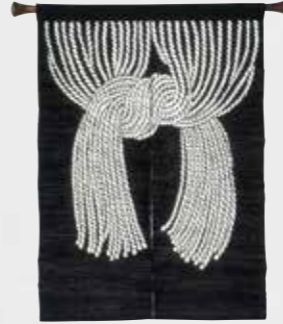
▲ Noren (Entrance Curtain) with Nawanoren (Straw-rope Curtain), Stencil-dyed Cotton, 1955