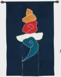
▲ Noren (Entrance Curtain) with Chinese Character Kotobuki (Long Life), Stencil-dyed Cotton, 1974