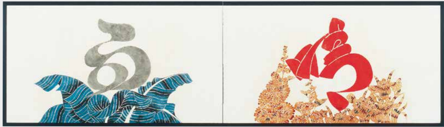
▲ Two-panel Screen with Chinese Characters Hare (Sunshine) and Ame (Rain), Stencil-dyed Paper, 1962

The museum's collections include some 200 examples of Serizawa Keisuke's multifaceted work, including kimonos, noren (Entrance curtains), wall hangings, furoshiki (textile wrappers), folding screens, hanging scrolls, framed paintings, fabric patterns, lamp designs, and sketchbooks. Some of these pieces are rarely seen examples of "work in progress," illustrating the artist's creative process. In addition to Serizawa's own work, the museum possesses about 10,000 items produced by the Serizawa Keisuke Paper-dyeing Workshop, including calendars, furoshiki patterns, fans, greeting cards, postcards, and matchbook covers.