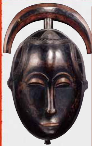
▲ Baule Mask, Côte d'Ivoire