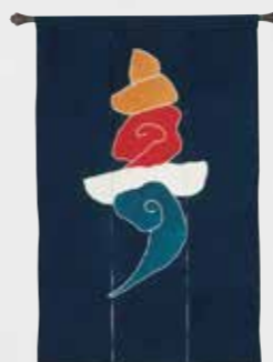
▲ Noren (Entrance Curtain) with Chinese Character Kotobuki (Long Life), Stencil-dyed Cotton, 1974