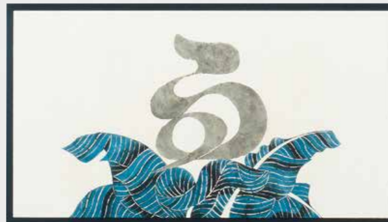
▲ Two-panel Screen with Chinese Characters Hare (Sunshine) and Ame (Rain), Stencil-dyed Paper, 1962

The museum's collections include some 200 examples of Serizawa Keisuke's multifaceted work, including kimonos, noren (Entrance curtains), wall hangings, furoshiki (textile wrappers), folding screens, hanging scrolls, framed paintings, fabric patterns, lamp designs, and sketchbooks. Some of these pieces are rarely seen examples of "work in progress," illustrating the artist's creative process. In addition to Serizawa's own work, the museum possesses about 10,000 items produced by the Serizawa Keisuke Paper-dyeing Workshop, including calendars, furoshiki patterns, fans, greeting cards, postcards, and matchbook covers.