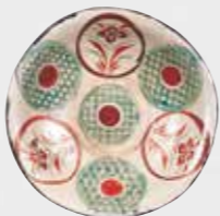
▲ Dish with Floral Design in Painted Enamels on Pottery, about 1940