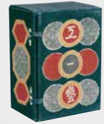
▲ Wrapper for Volumes of Kogei (Craft) Magazine, Stencil-dyed Cotton, about 1932