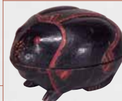
▲ Black-lacquered Container in Frog Form, Thailand