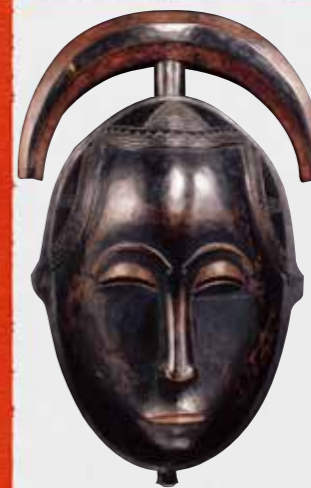
▲ Baule Mask, Côte d'Ivoire