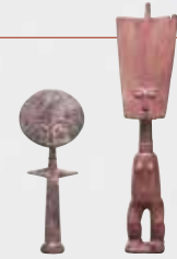
▲ Akua'ba (Fertility Dolls Carried by Young Women), Ghana