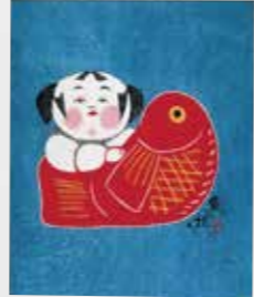
▲ Doll Holding a Seabream, Stencil-dyed Paper, 1969