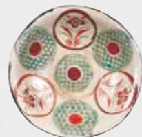
▲ Dish with Floral Design in Painted Enamels on Pottery, about 1940