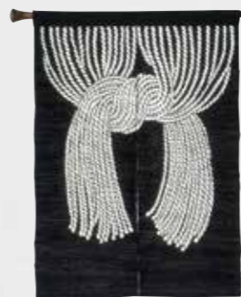
▲ Noren (Entrance Curtain) with Nawanoren (Straw-rope Curtain), Stencil-dyed Cotton, 1955