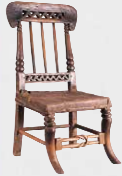
▲ Leather-covered Chair, Côte d'Ivoire