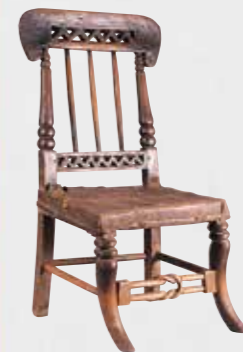
▲ Leather-covered Chair, Côte d'Ivoire