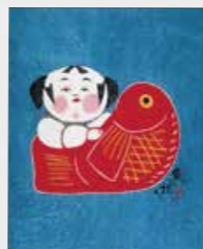
▲ Doll Holding a Seabream, Stencil-dyed Paper, 1969